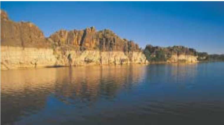
Geike Gorge is one of the most successfully marketed Kimberley icons (26) - Hugh Brown

Fringed by paperbarks, Pandanus , freshwater mangroves, river gums and native figs the gorge is subject to immense volumes of water flow during the wet season.